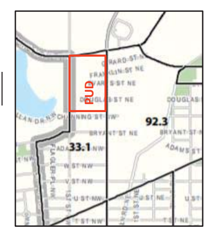
Census Tracts 33.01 and 92.03

The State Data Center provided a review of selected US Census comparative data from the 2005-2009 ACS versus the 2011-2015 ACS<sup>4</sup> for census tracts 33.01 and 92.03 (the census tracts including the PUD and the adjacent residential neighborhoods). The data show no indication of destabilizing land values. In general, the growth in population is significantly less than the rest of the District, the growth in total households is less than the growth is households District-wide, the area is becoming culturally more diverse, the poverty rate has decreased in the neighborhoods at a faster rate than District-wide, and median home values have increased at a rate relatively comparable to the District-wide value.